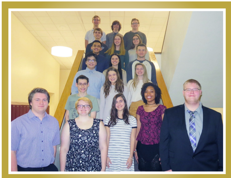
Illinois State Scholars are ranked in the top ten percent of all students in Illinois based on their grades and test scores