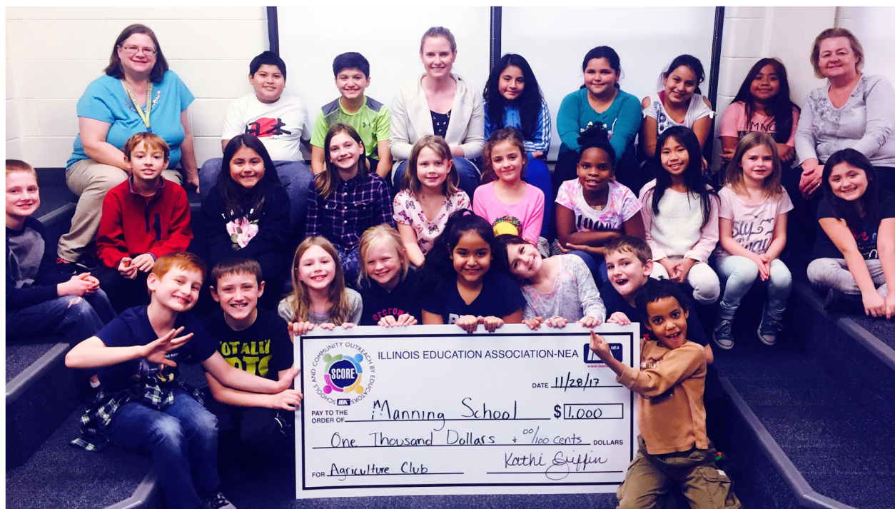
The new Agricultural Club, funded by a SCORE grant, joins the Say No to Drugs Club, Student Council, Environmental Club, 5th Grade Band, Drama Club and Choir.