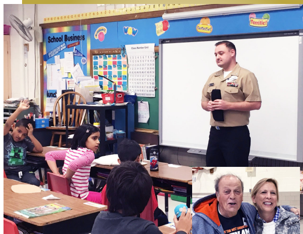
The Miller staff cooked pancakes, eggs and sausage for the 20 veterans who visited the school this year

The Miller staff cooked pancakes, eggs and sausage for the 20 veterans who visited the school this year. Our guests told stories about what it means to be a patriot and honor the country with their bravery and courage. Students were able to ask in-depth questions about personal experiences that related to what it means to be a soldier and a part of the American military.