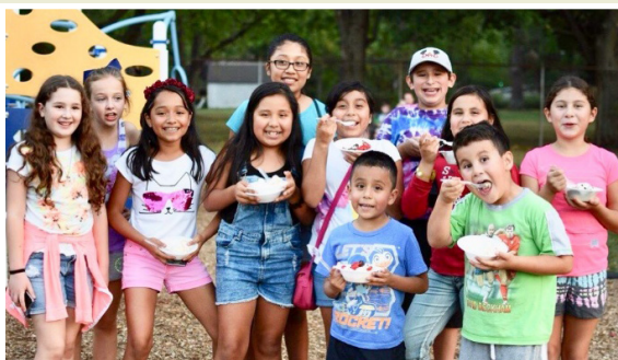
The PTO Ice Cream Social was a big hit with students