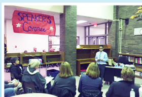
Students participate in Speakers' Corner where they share what they've learned in a small group setting