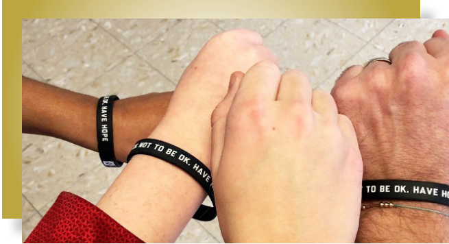
HFTD will be opening "Sip of Hope" cafe in Chicago, which will be the first shop in the world where 100% of their proceeds will support suicide prevention initiatives.