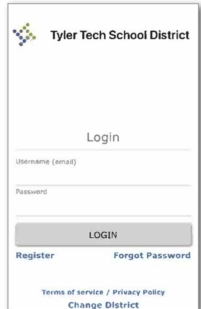
App Login Screen